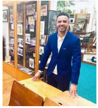
Visiting the Old Dillard Museum