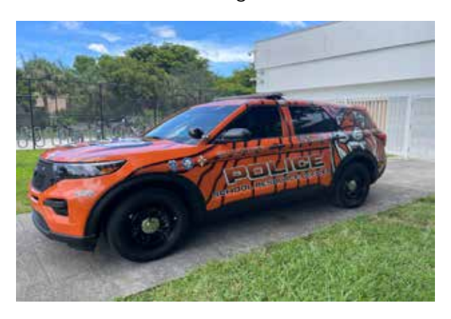
The new wrap design on the Piper High School SRO vehicle.